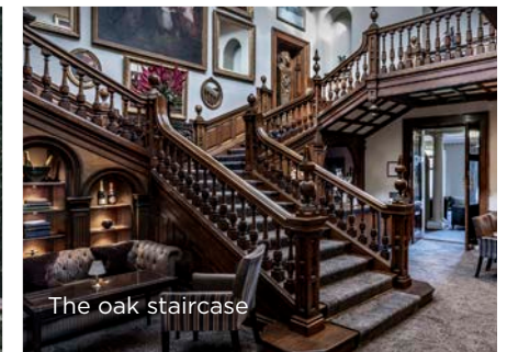
The oak staircase