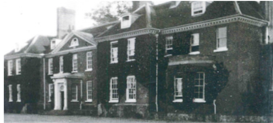
Chilston Park in the 1930s

From the moment I opened the large gate, the sort that you stand on and swing to and fro, I was fascinated. A very long drive with meadow and trees, very quiet and peaceful.