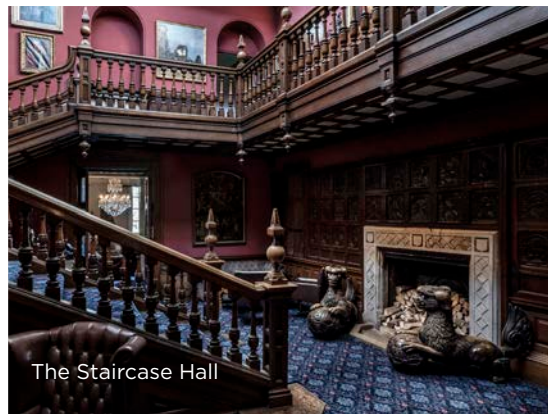
The Staircase Hall