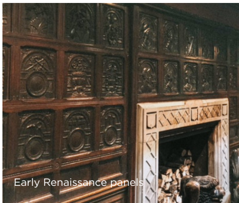
Early Renaissance panels

During the 1950s, the house underwent a major change. The Victorian wing, built in the 1880s was demolished, so returning Chilston's exterior appearance to the 18th century.